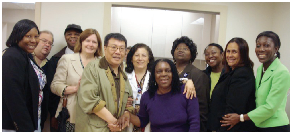
The NCHC senior management team celebrates the reopening of 444 William Street